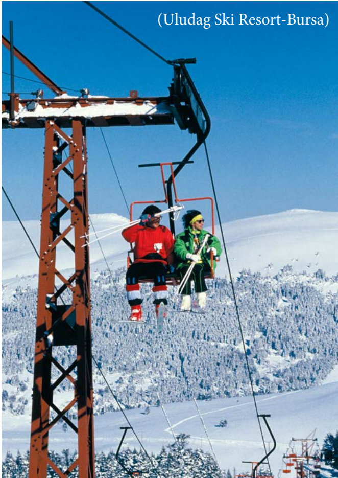
(Uludag Ski Resort-Bursa)